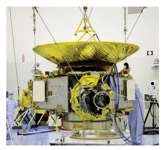
NEW HORIZONS CRAFT