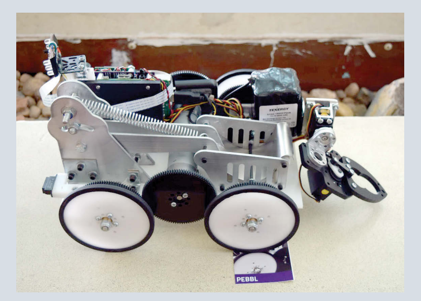
THE 2016 KSURCT ENTRY, PEBBL

In 2016, the club members decided to again compete in the Mercury Robotics Competition and do better than last year. The team brought in fresh faces, along with electrical engineering, mechanical engineering and computer engineering leads to work on the hardware, physical robot and software. Together, members were able to construct a robot from the ground up. The robot, PEBBL — Pi-Embedded Bean Bag Launcher — was entered in the competition in Stillwater and was able to perform very well; however, along with 50 percent of the teams, the K-State group was unable to complete the course and identified challenges to overcome in the next years. Over the summer, team members will be generalizing the software to make it independent of robot design.