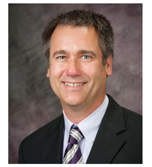
Department Head Electrical and Computer Engineering