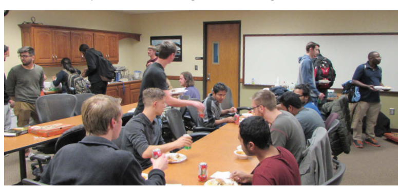
STUDENTS ENJOY FALL 2015 HKN CHILI FEED DURING FINALS WEEK.

Next year, Eta Kappa Nu hopes to grow further, and expand on the interaction of students and faculty. It also hope to increase its membership and involvement at the graduate-student level to help connect the department's undergraduate and graduate students.