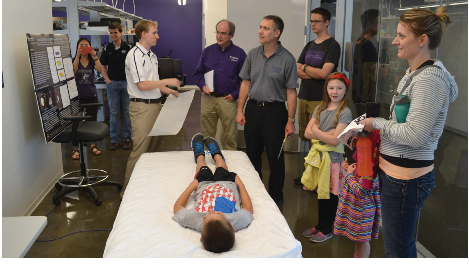
A KANSAS STATE UNIVERSITY ENGINEERING TEAM HAS RECEIVED A THREE-YEAR $400,000 NATIONAL SCIENCE FOUNDATION GRANT TO TRACK THE WELLNESS OF SPECIAL NEEDS CHILDREN AT NIGHT AND RELATE THIS SLEEP DATA TO DAYTIME LEARNING AND BEHAVIOR

"While relationships between sleep quality and daytime performance are well-characterized for neurotypical children, these relationships are not well known for severely disabled, autistic children, many of whom are nonverbal and have multiple co-existing disabilities,"