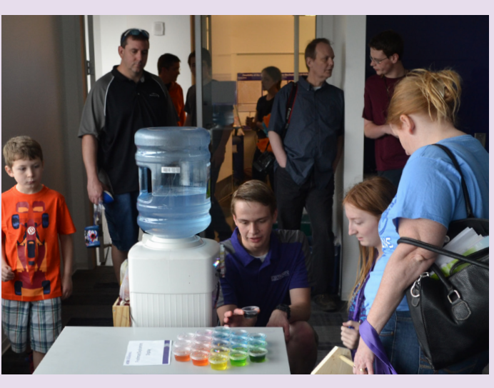
UNDERGRAD STUDENTS PRESENT AWARD-WINNING DISPLAYS AT OPEN HOUSE